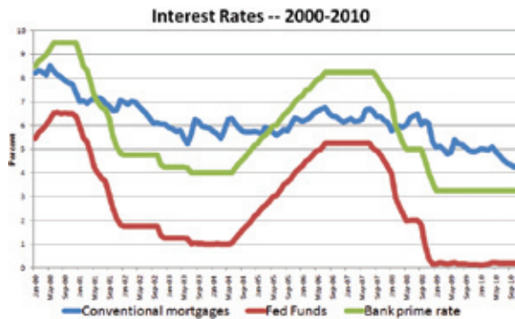
Source: Federal Reserve Statistics Release H.15

The value of a bond over its lifetime is directly related to (1) the perceived risk of default and (2) current interest rates. If you purchase a bond during a period when 6% interest rates are the norm, and interest rates subsequently fall, your bond could be worth more than its face value. If interest rates were to go up, the value of your bond, if sold prior to maturity, would fall because an investor could purchase other bonds offering higher returns.